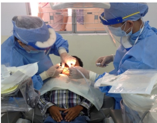
Dental care is important for kids with HIV