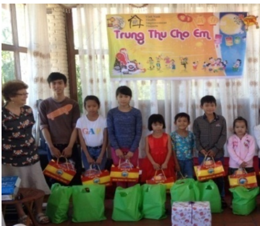
Children celebrate the Full Moon Festival