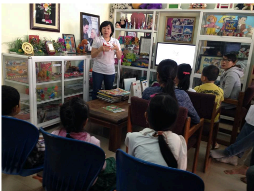
Oral health education at EMWDC