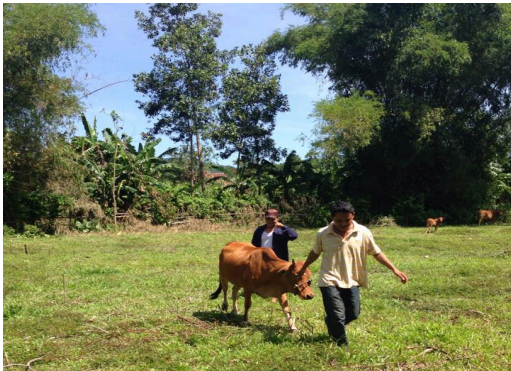
Loans help families income security

One of VNHIP's goals is to improve the health and wellbeing of children living with HIV in central Vietnam and to improve the financial status of families living with HIV. We now have regular contact with 14 children living with HIV and their families.