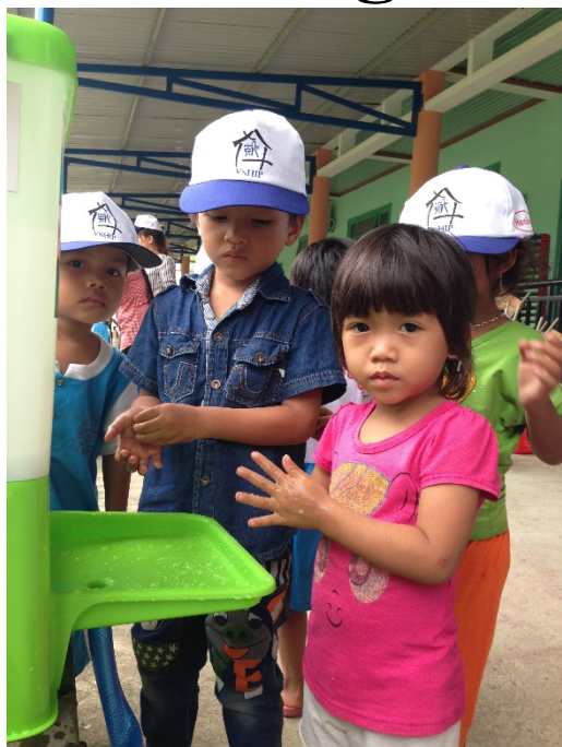
Clean hands prevent disease

In the last 6 months, we have provided hand washing training sessions in all 16 schools in Ca Dy commune, Nam Giang District. These sessions were run by VNHIP staff with the support of the school teachers. During the training we encouraged the children to answer the questions so they felt more confident and remembered the knowledge better. We set up 70 hand washing stations and provided soap for all 16 schools.