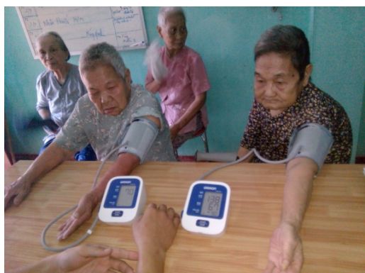
VNHIP protocol improving patient care

In October 2015, the VNHIP team met with the WHO non-communicable diseases team to discuss progress on the wider use of the protocol we developed in order to better manage hypertension and diabetes in Vietnam at the commune level. The officers from WHO informed us that the protocol was being trialed in one province and that its use would be expanded throughout Vietnam over the next five years.