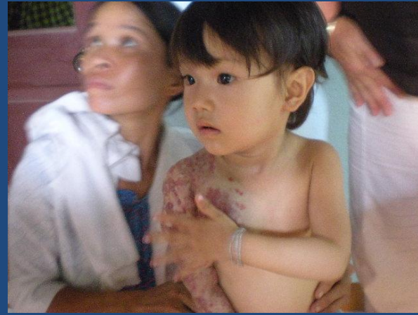
A young patient of ours with a large hematoma